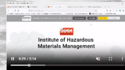
Recertification Video #1

When navigating to the recertification section of the IHMM website, also found on your specific credential's landing page, please note two instructional videos.